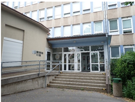
Entrance to the RB building, the venue of the conference. (NB: RB is the name of the building within the university's rectorate complex on Šrobárová Street)