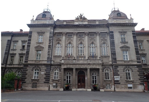
The building of the rectorate of the Pavol Jozef Šafárik University in Košice on Šrobárová Street.